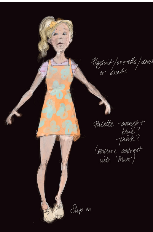
Her main character is Juliet.