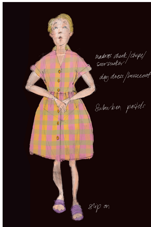
She also plays Mother.