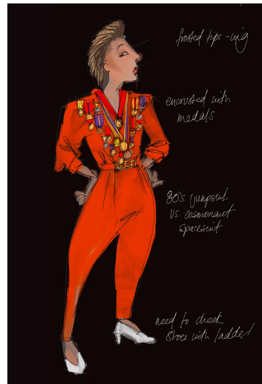
And Valentina Tereshkova and Dustin Hoffman.